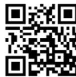
High Plains Ranch Practicum Videos http://bit.ly/ PracticumVideos

“Yes, this will help me become a better manager/owner when I take over the ranch and show the parents I am truly interested in taking over.”